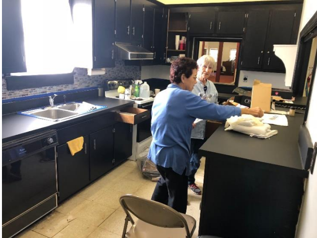
Renovating the Kitchen at St Timothy's Church