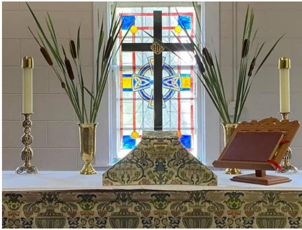
St. Timothy's Altar

St. Timothy's Theological College and Seminary (STTCS) is an Anglican college and seminary that seeks to help you to answer your call to ministry by providing the education and technology you need to serve. Our program is designed so that the majority of your work can be done at home, either by correspondence, Zoom, Skype or by webinars with your professor