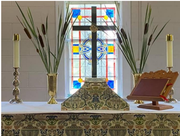
St. Timothy's Altar

St. Timothy's Theological College and Seminary (STTCS) is an Anglican college and seminary that seeks to help you to answer your call to ministry by providing the education and technology you need to serve – at no cost. If accepted, there is no tuition and your books and other course materials are all provided.