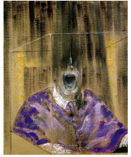
Figure 1. Francis Bacon's Head VI

Figure 1 (left) is a painting by Francis Bacon that is modelled on Diego Velázquez's Portrait of Innocent X. The subject, in a kind of materialistic box, is being torn apart, as if the fabric of the universe itself was dissolving. This picture is part of a series of studies by Francis Bacon – a parody of a portrait of the Pope himself. But he is not really painting a picture of the Pope – or his inner disposition. This is a picture of modern man. If modern man's theory of the universe is true, then this is the irrevocable fate of man. But if the New Testament is true, this is the horror to which the soul of modern man is even now being subjected and from which he must be delivered.