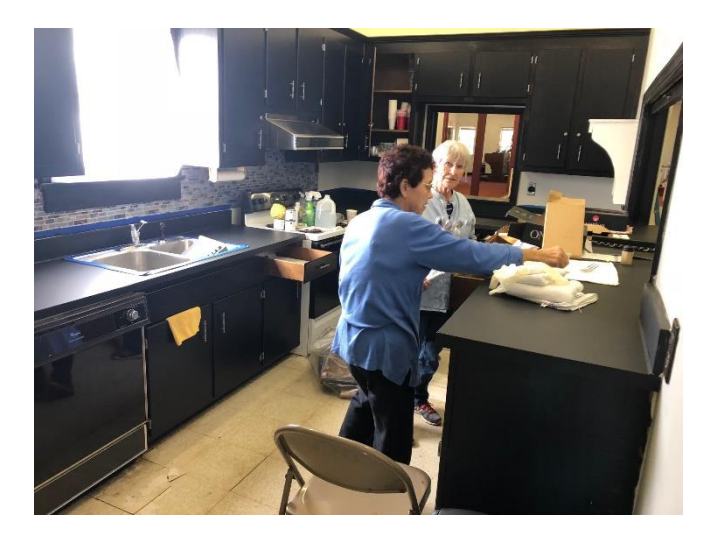
Renovating the Kitchen at St Timothy's Church