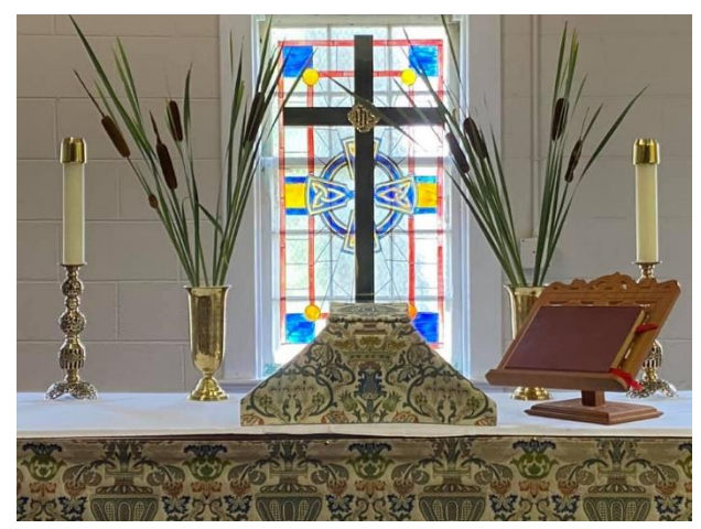
St. Timothy's Altar